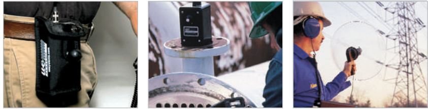
Accessories for enhancing test procedures available