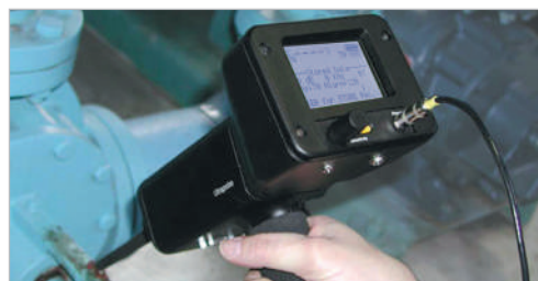
Test/Trend all types of machinery

Ultratone. A unique method that is also employed for heat exchangers is the "Ultratone" method in which a powerful high frequency transmitter floods the shell side of the exchanger with ultrasound. The generated sound will follow the leak path through the tube. A scan of the tube sheet will indicate the leaking tube.